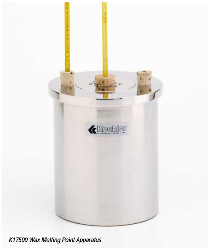
K17500 Wax Melting Point Apparatus