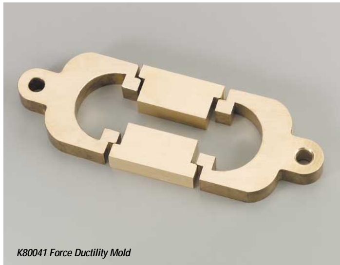
K80041 Force Ductility Mold

Shipping Weight: 20 lbs (9.1kg) Dimensions: 3.4 Cu. ft.