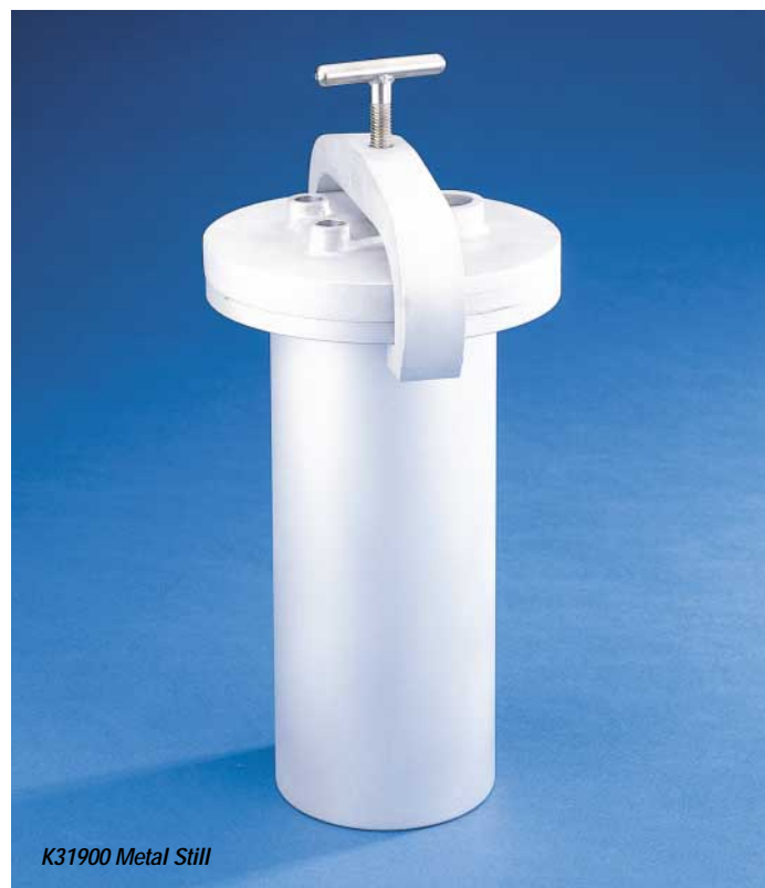
K31900 Metal Still

For NIST traceable certified thermometers, please refer to the ASTM Thermometer section on pages 184 through 191.