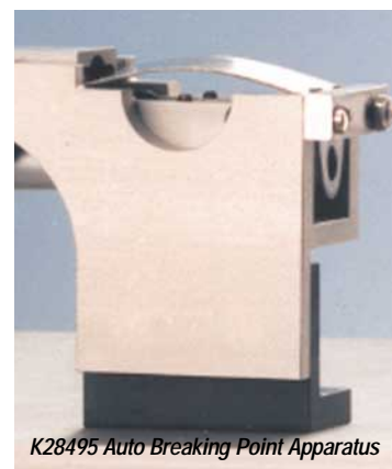
K28495 Auto Breaking Point Apparatus

Shipping Weight: 33 lbs (15kg) Dimensions: 5 Cu. ft.