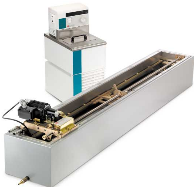
K80020 Constant Temperature Ductility Machine with Circulator