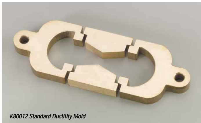
K80012 Standard Ductility Mold