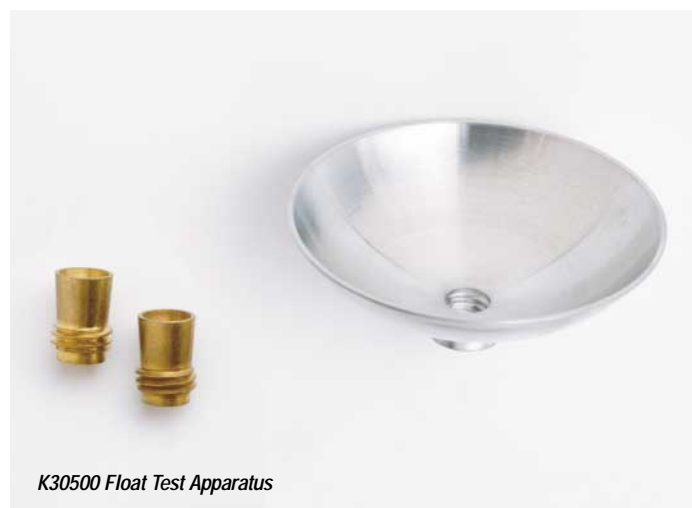
K30500 Float Test Apparatus

For NIST traceable certified thermometers, please refer to the ASTM Thermometer section on pages 184 through 191.