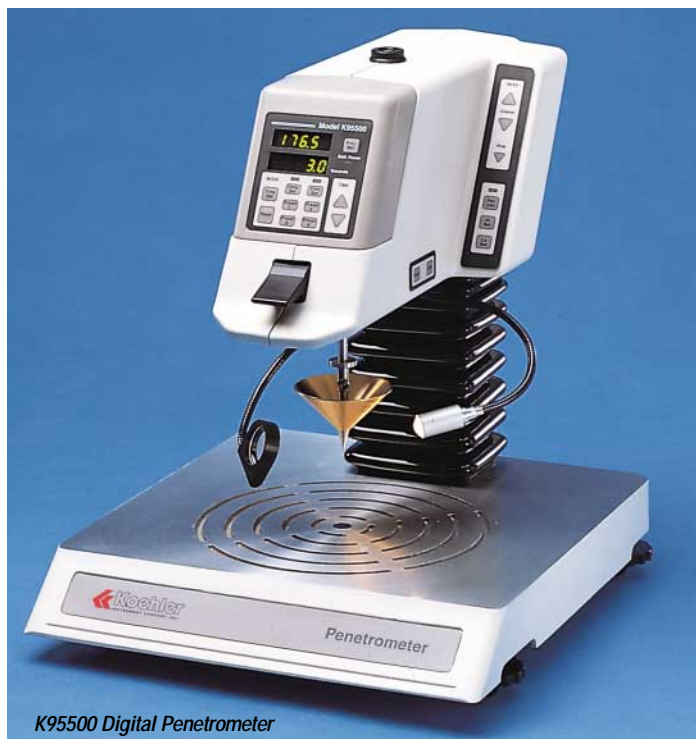
K95500 Digital Penetrometer

For NIST traceable certified thermometers, please refer to the ASTM Thermometer section on pages 184 through 191.