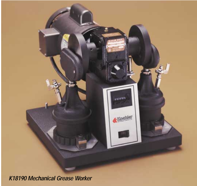
K18190 Mechanical Grease Worker