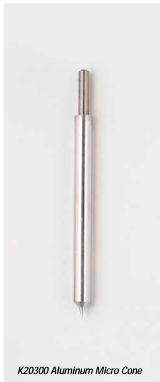
K20300 Aluminum Micro Cone