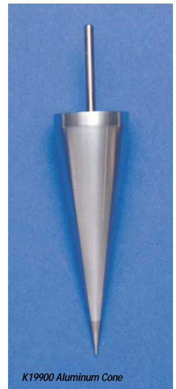
K19900 Aluminum Cone