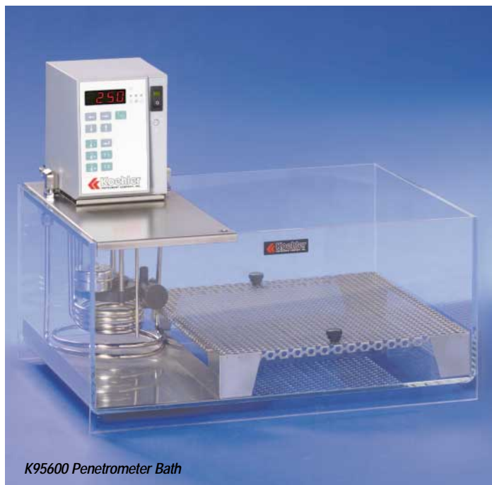
K95600 Penetrometer Bath