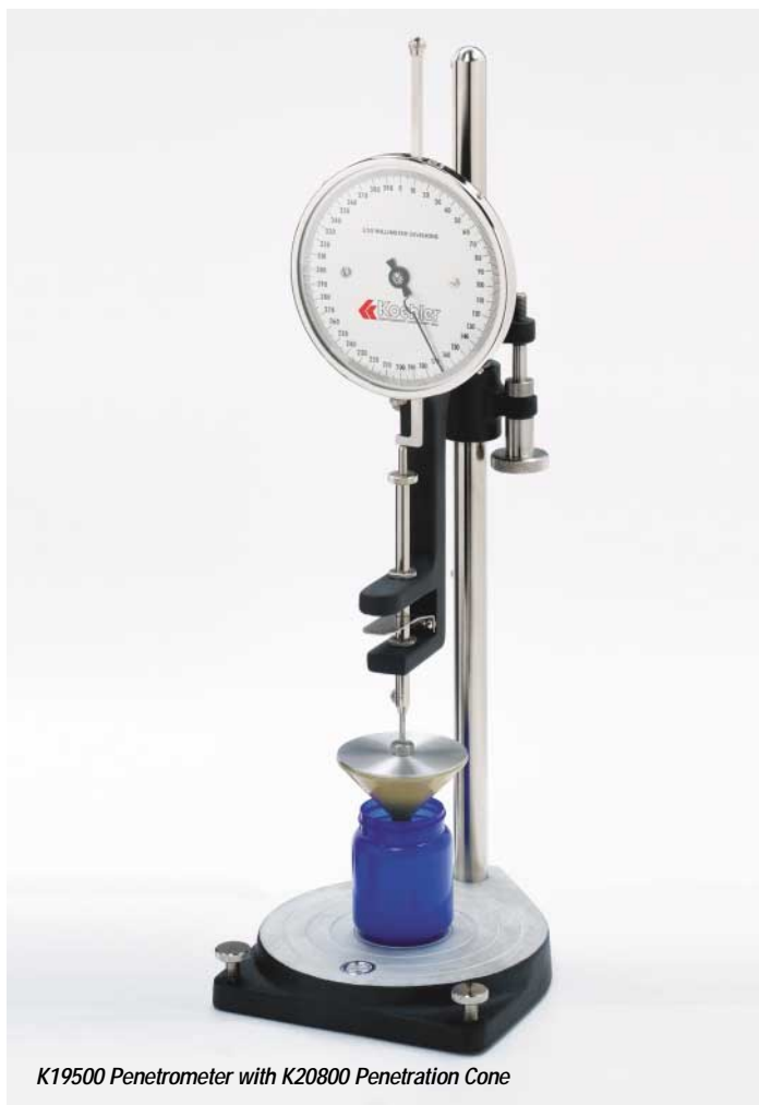
K19500 Penetrometer with K20800 Penetration Cone